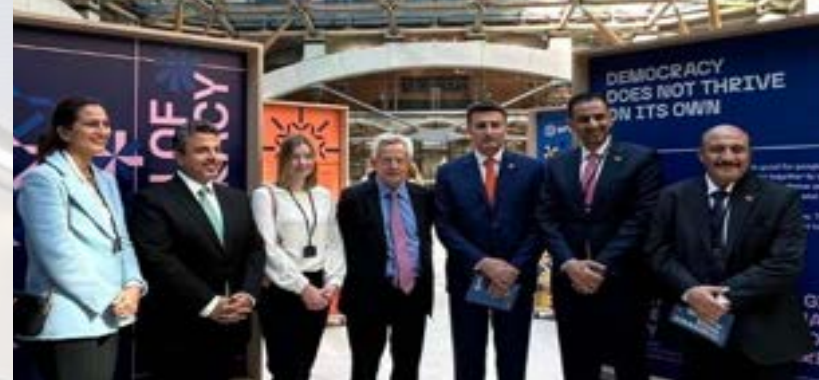
Discussing a new WFD democracy programme with the Jordanian Speaker