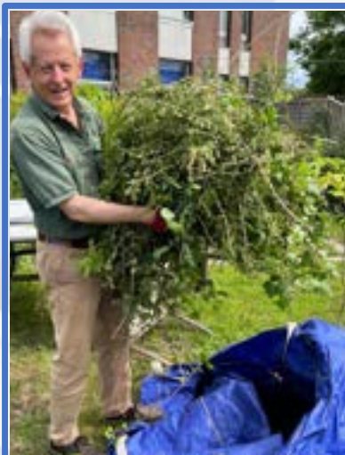
Gardening at GRH to help maintain green spaces for staff