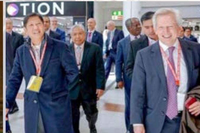
Highlighting UK aviation and aerospace skills to Philippines President Marcos at Gatwick Airport