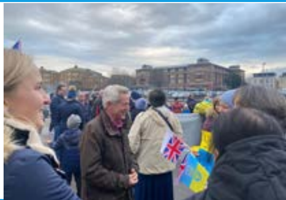
Always supporting Ukraine events