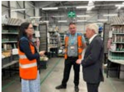
Better Royal Mail services