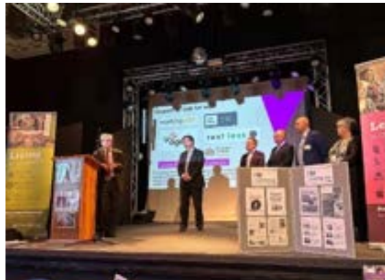
The first Gloucester 50PLUS Choices Event