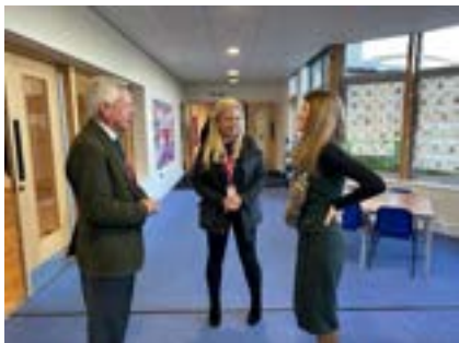
Visiting 31 schools, celebrating their successes and encouraging tree planting