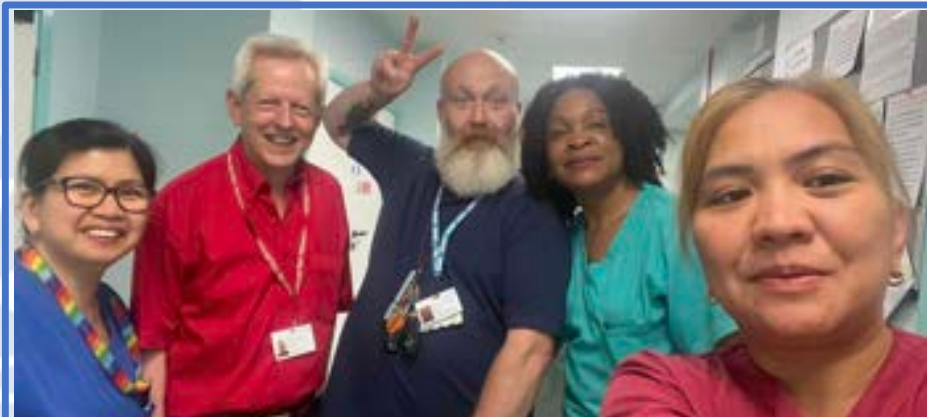
Volunteering on wards to see first-hand the dedication of GRH staff