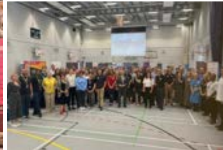
Aspiration for under 18s at the Gloucester Academy Opportunities Fair