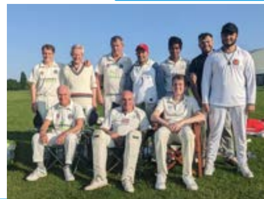
Playing cricket for the seventeenth year running for Gloucester CC