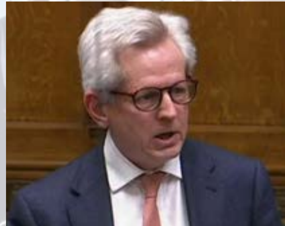
Speaking in Parliament and making the case for a spiking law