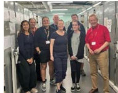
Volunteering at GRH