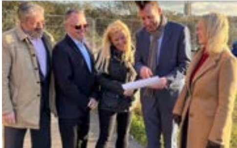
More brownfield fund development