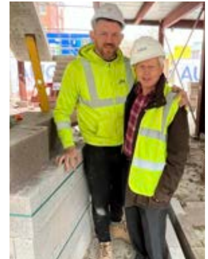
Skills and apprenticeships in construction