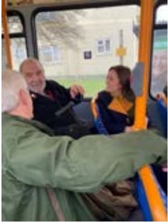
Punctual bus services