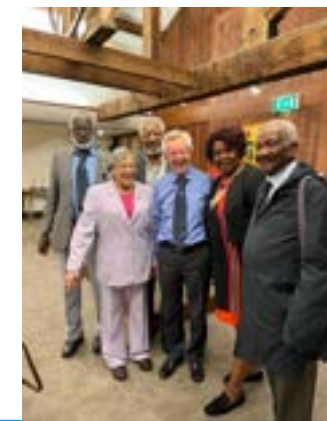
Celebrating links with St Ann Jamaica