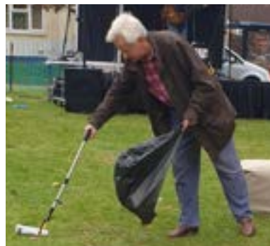
Litter picking wherever possible