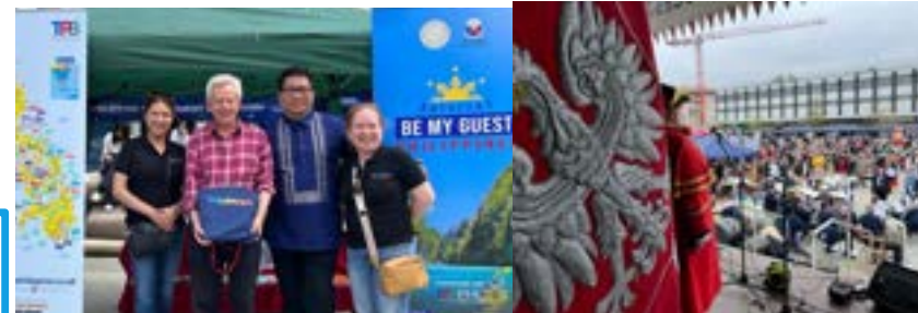
Welcoming guests to the Philippines and Polish heritage days